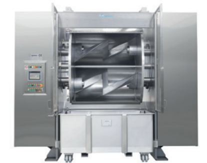
Industrial mixer with double sigma-shaped mixing arm

biscuits, crackers, snacks, chewing gum, bubble gum, gum base, toffee, broth cubes, pharmaceutical products, butyl sealants, mastics, putties, glues, colours and pigments, special lubricants. Apinox mixers are the result of years of experience both in the mixing techniques and in the level of technology used. The mixing arm, without a central shaft, has been designed to perform a rapid dispersion of all the ingredients and a controlled processing of the dough. The unloading of the dough can take place in wheeled tubs or on a conveyor belt/hopper. Apinox mixers are equipped with safety systems that guarantee the safety of the operators and comply with the regulations in force. All Apinox mixers are EC certified and upon request also ATEX, UL, CSA and HAZLOC certified.