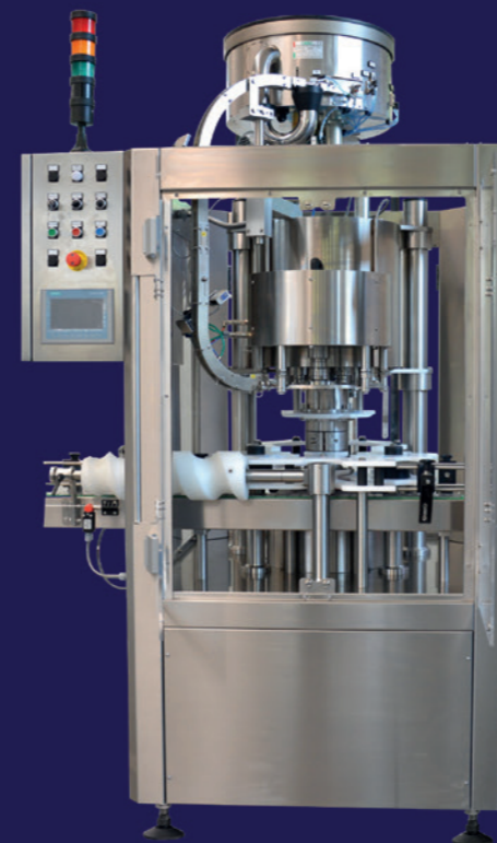
AUTOMATIC Capping Machine Mod. SIRIO (Pick & Place)

Deep-rooted in tradition, projected into the future