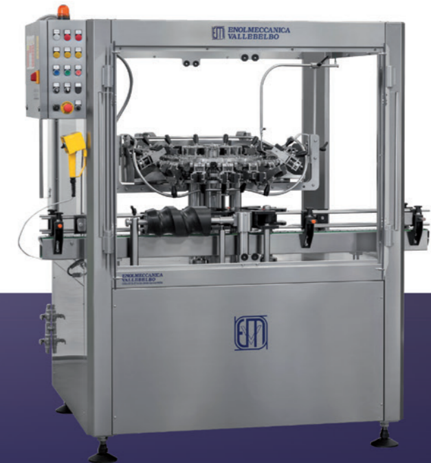
AUTOMATIC Rinser Machine Mod. DOLPHIN

Deep-rooted in tradition, projected into the future