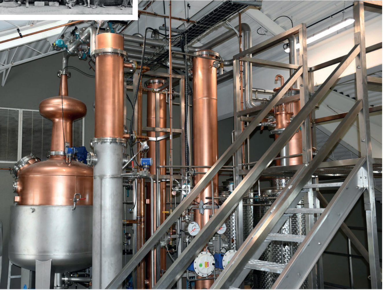
Tawse Winery, Canada - pot stills for Whisky, Brandy, Gin and Vodka production