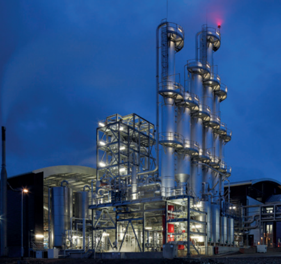
Glen Turner, Scotland - complete distillery for 75,000 l/day Whisky and alcohol production

distillates, raw alcohol, extra neutral and absolute alcohol, with its own know-how, advanced technologies and experience developed worldwide.